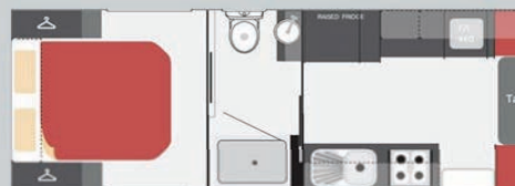
TUNGSTEN TOURER 22 FT