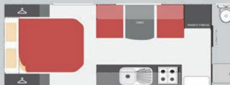
TUNGSTEN TOURER 20 FT