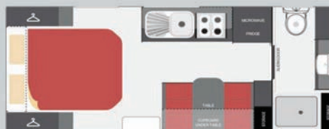
TUNGSTEN TOURER 17FT