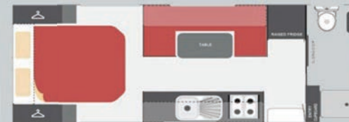
TUNGSTEN TOURER 20FT