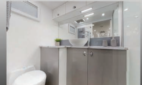
Illustration & Specifications are for information only and may change without notice. Always check with your Sales Consultant.